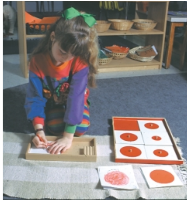
Photos in this article were taken at Montessori School of Anderson in Anderson, SC